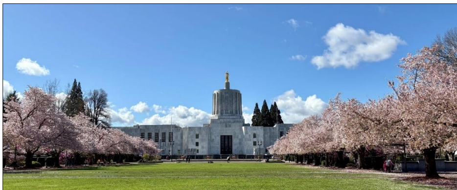
Cherry blossoms at the Oregon Capitol Mall, March 2026.