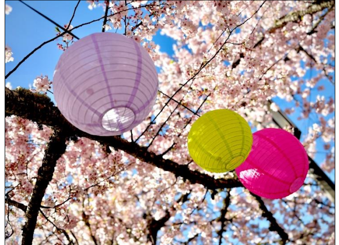
Lanterns hanging among the cherry blossoms at the Oregon Capitol Mall, March 2026.

The Oregon PDAB and Oregon Drug Price Transparency (DPT) Program have been reviewing their websites and reformatting documents to make them easier to read for people who use assistive technology, such as a screen reader. Staff members have reorganized files and created archive folders. If you have any difficulties finding website content, please email PDAB at pdab@dcbs.oregon.gov or DPT at rx.prices@dcbs.oregon.gov so we can help.