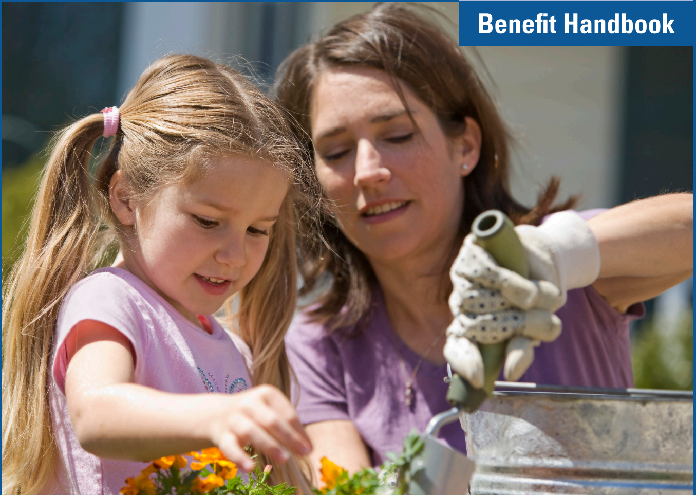
Exhibit 1 to OAR 836-053-0012