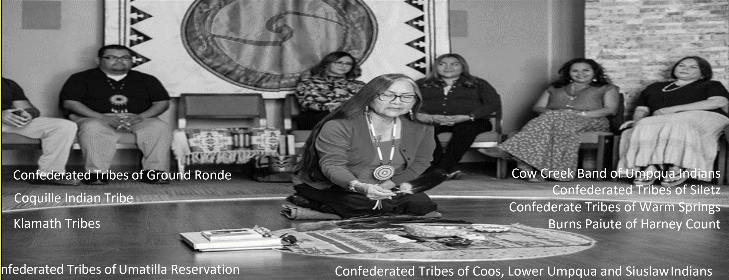
Confederated Tribes of Ground Ronde Coquille Indian Tribe Klamath Tribes